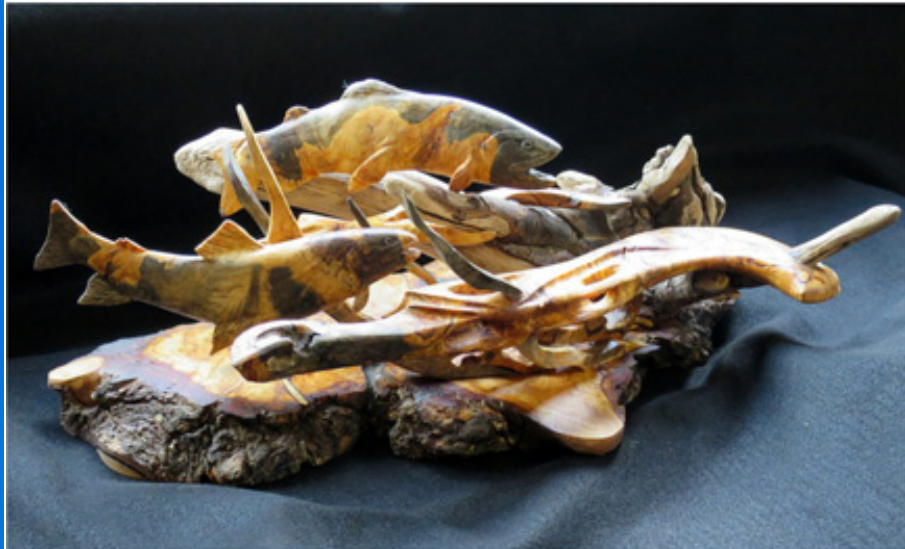
'Slip Stream' – Wood Assembly by Tom Blaue